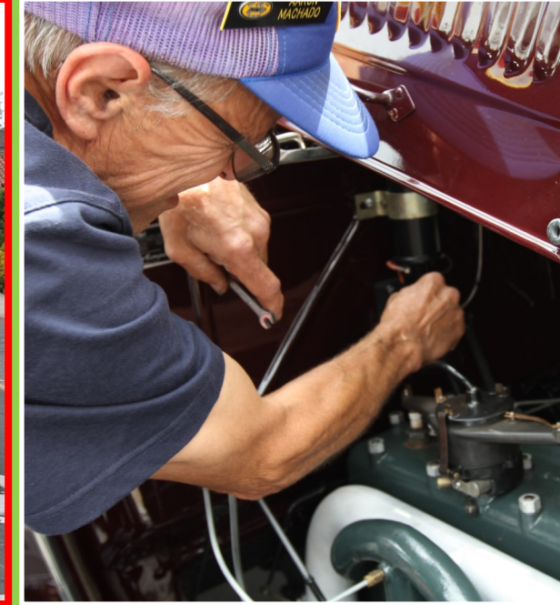
August 2019 the Mohair flyer Page 3