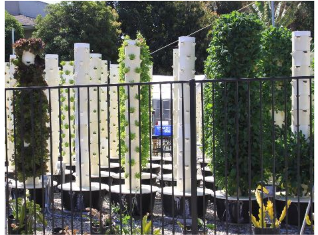
Growing towers at Pilgrim Terrace