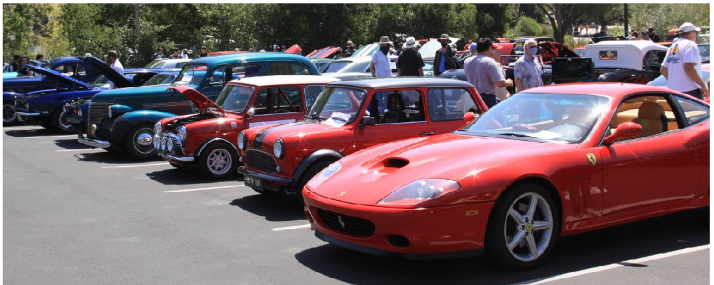
Car show at Southcoast Church