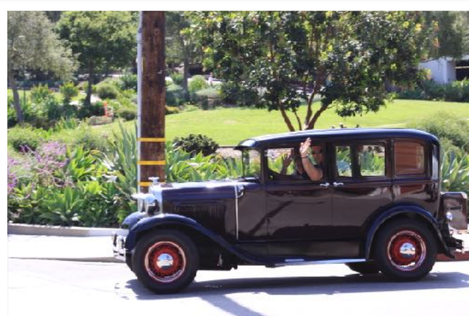
Fordors appear to be the model of choice