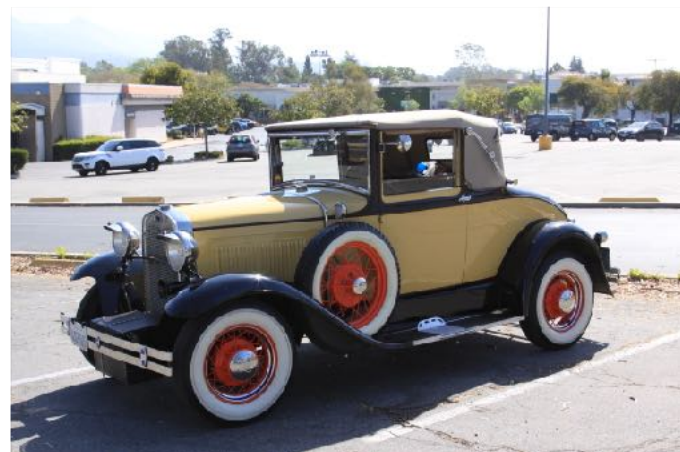
Lorne's car will need a driver