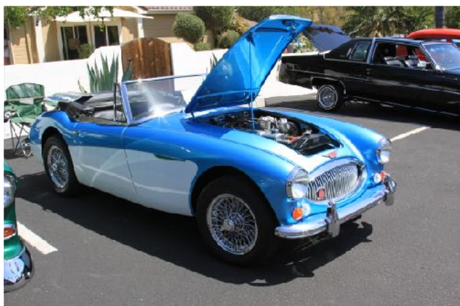
A nice Austin-Healey