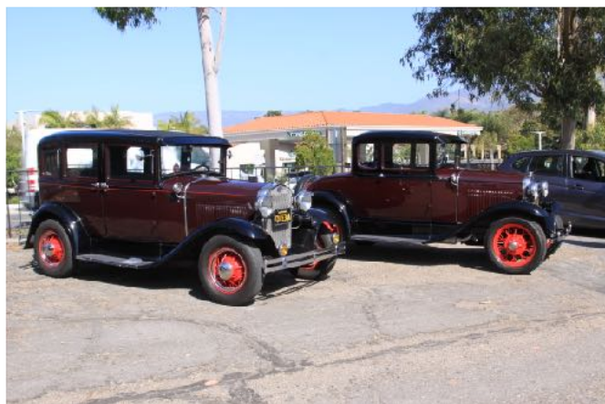
Members and cars poised to begin our tour around town