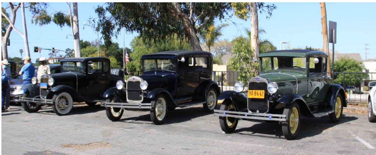
Gentlemen and Ladies, start your engines!