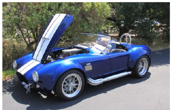
Is it a Ford? (A Shelby Cobra)