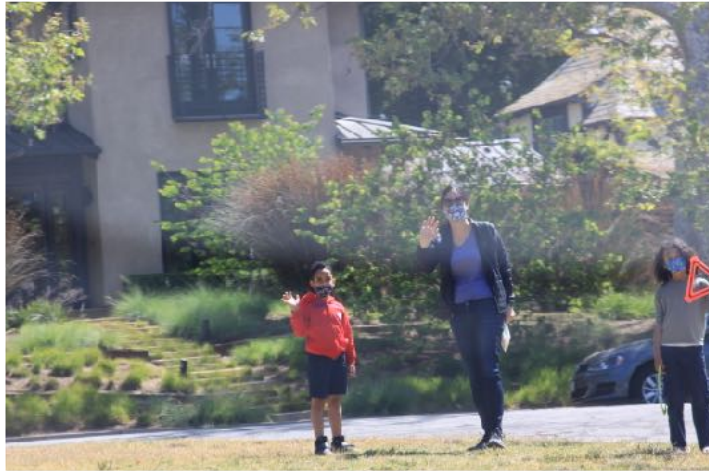
Fans waving at our drive-by at Valle Verde