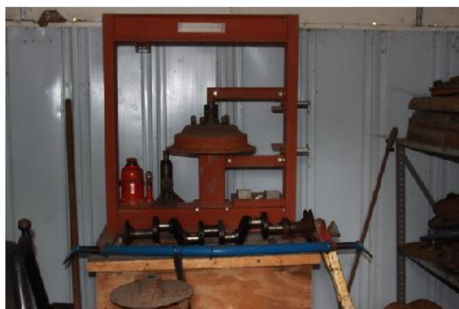
The Club's storage shed with old parts and tools—back lot at Tierra