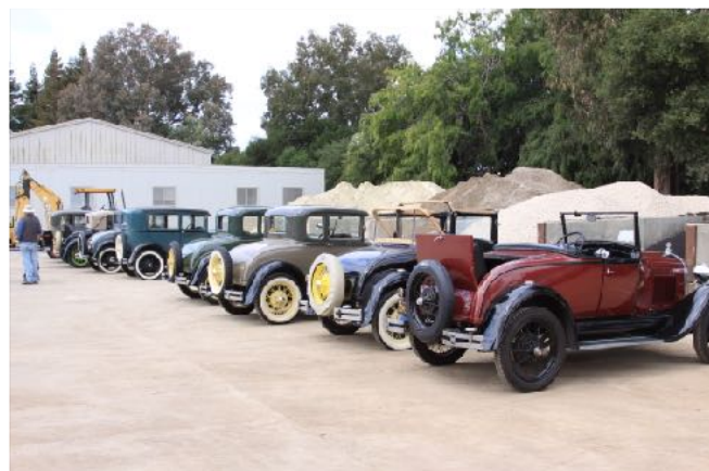
Ladies' Gabfest and members' cars