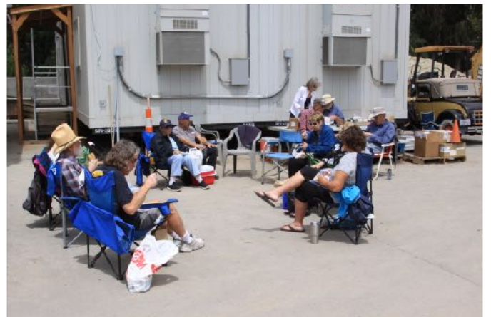
Cars and members