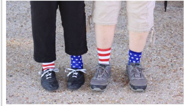
Forth of July special socks