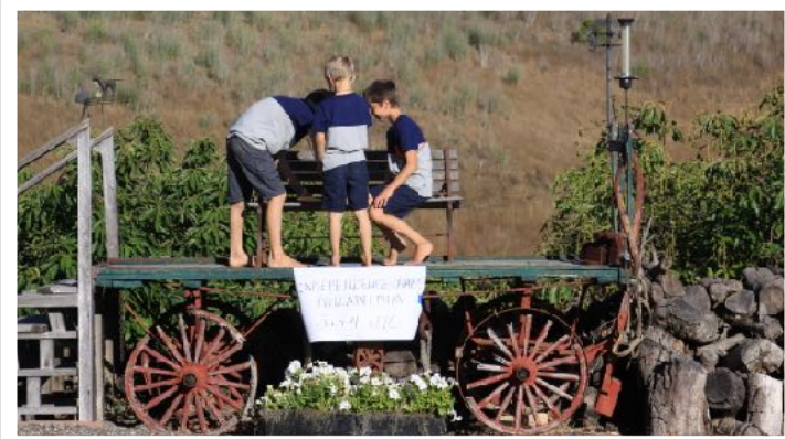
The grandkids put on a patriotic skit for the crowd