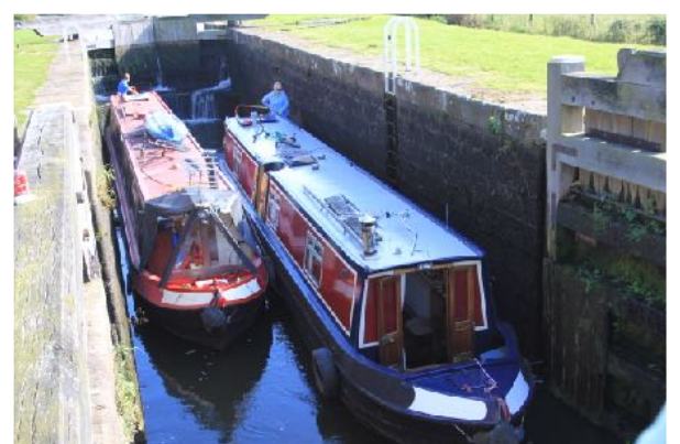
Two narrowboats in a lock