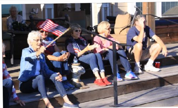
Patriots enjoying the celebration