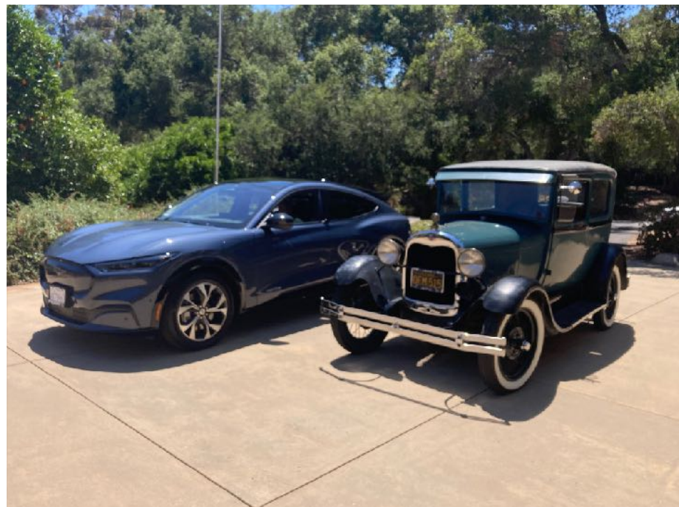
2021 Ford Mach-E and 1929 Grampa