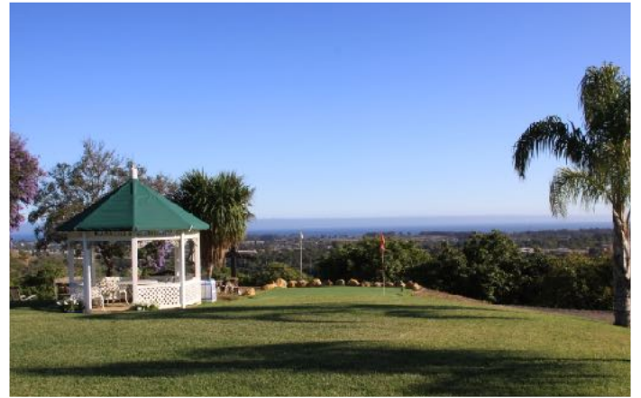
Nice view of the ocean from the lawn area