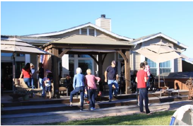
Everyone enjoying the day and the conversation