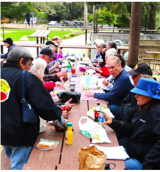
Our club enjoying lunch at Manning Park.