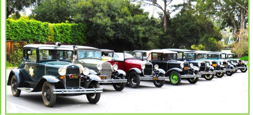
Our 13 Model As parked at Manning Park.