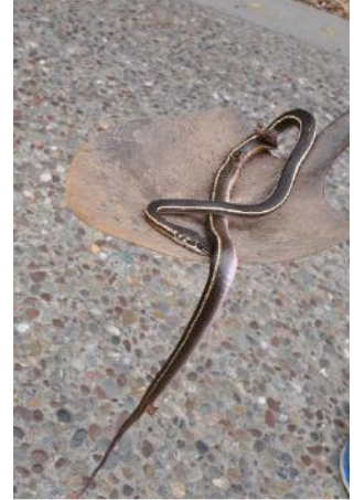
Visiting dead snake!