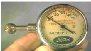
Air Gauge Cylinder Style