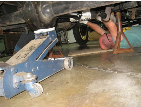
No problem here.