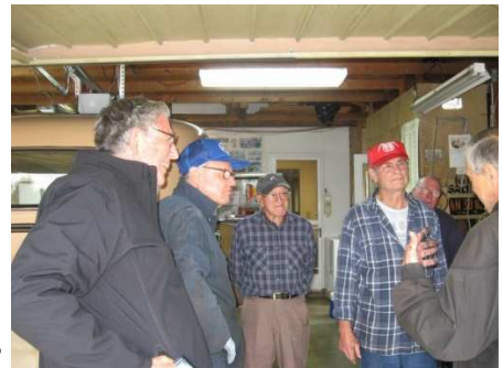
What'll we do?