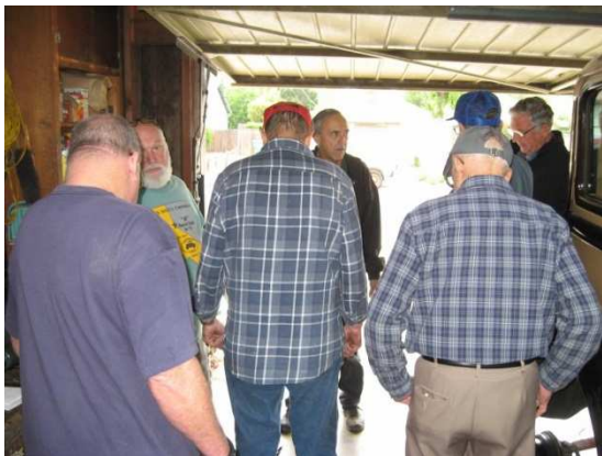
A prayer might help.