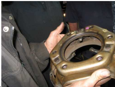
Ah, here's the problem..